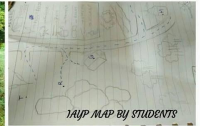
IAYP MAP BY STUDENTS